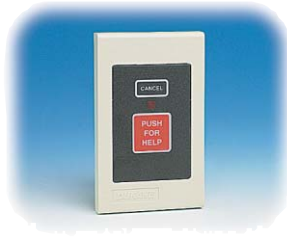
Push for Help