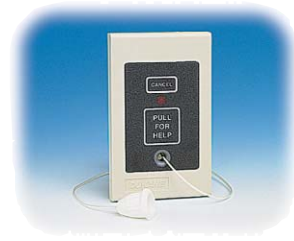
Pull for Help