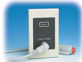
Call Cord Station