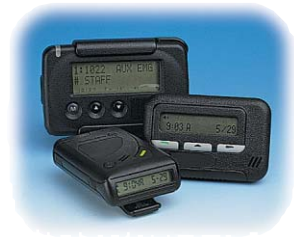
Pocket Page Integration