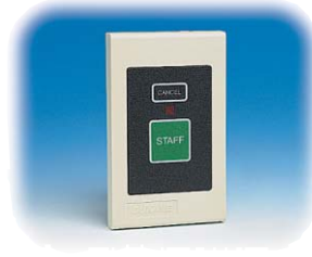
Staff Emergency Station